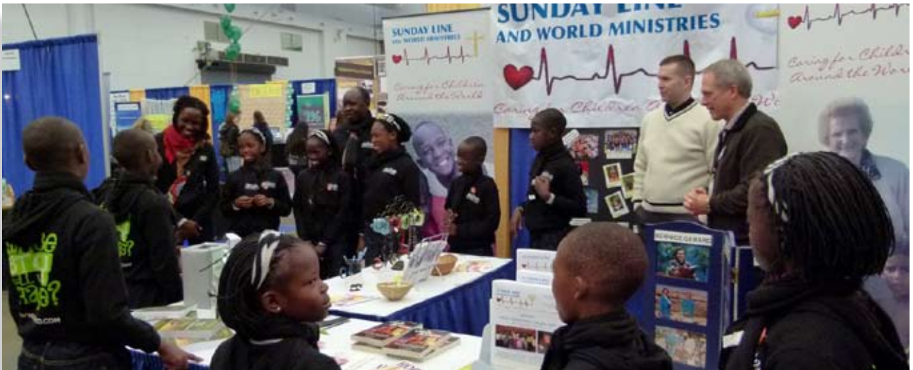
The Watoto Children's choir delighted passers-by as they sang and shared short testimonies while at the Sunday Line Missions Fest booth the last weekend of January. It was great to connect with so many friends, supporters and colleagues and to see and hear all that God is doing throughout the nations of the world.