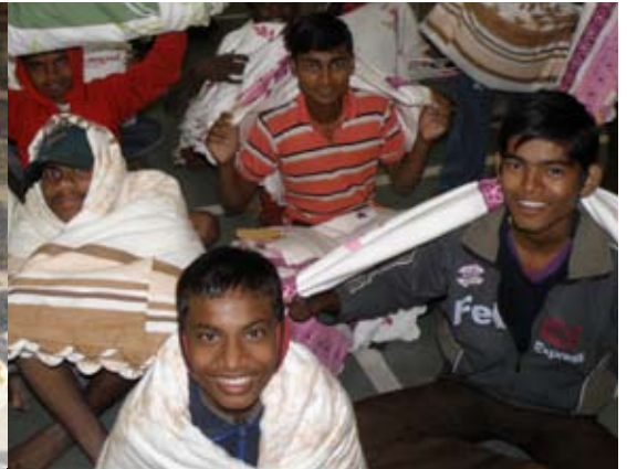
Continued from Page 1